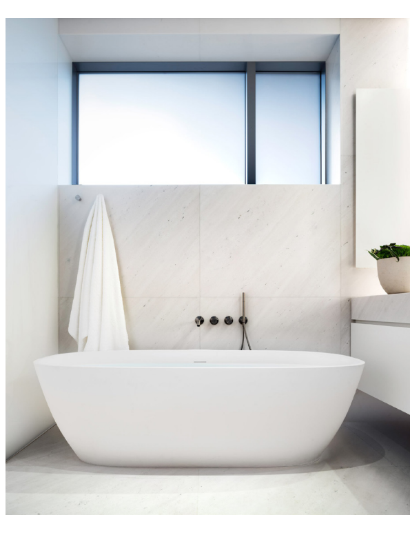
Clockwise from left: The master bedroom, designed on the principles of "simplicity, utility and comfort"; open spaces and pocket doors provide a view into the master bathroom; a seamless tub in the master bathroom rests on a heated floor; eucalyptus kitchen cabinets and Fango marble countertops give the kitchen its earthy, organic feel.